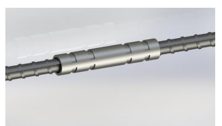
3. Repeat step 2 with the corresponding reinforcing bar to be spliced.