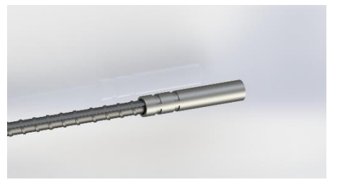
2. Place the rebar in sleeve and swage the sleeve with press.