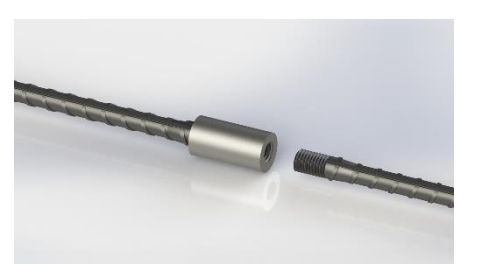
3. Align the corresponding rebar. Rotate the rebar to the middle of coupler.