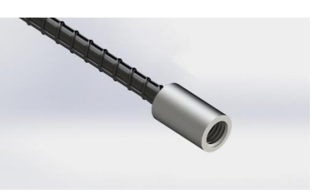
2. Screw the coupler on the threaded bar.